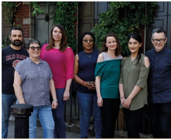
The Crisis House staff team