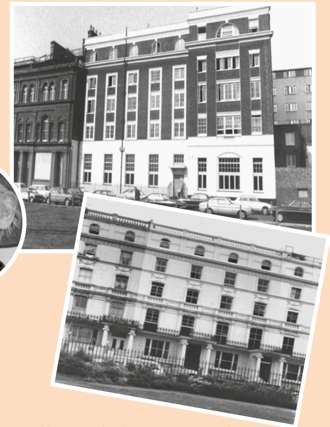
Top: Aldgate Hostel; Below: Bayswater Hostel

Bayswater Hostel opened, our second hostel in Westminster, offering 55 bedspaces.