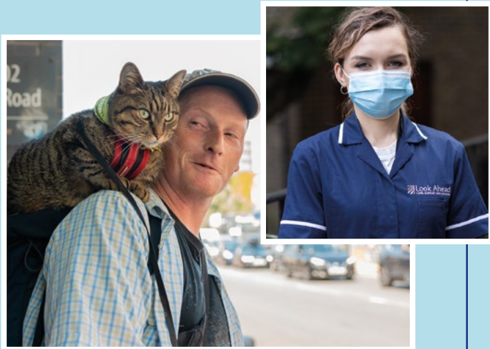
A customer outside one of our homelessness services in Tower Hamlets; Inset: A Look Ahead staff member during the COVID-19 pandemic

We celebrated the efforts of our frontline workforce through our 'Social Care Heroes' campaign, who continued to deliver services throughout lockdowns and beyond.