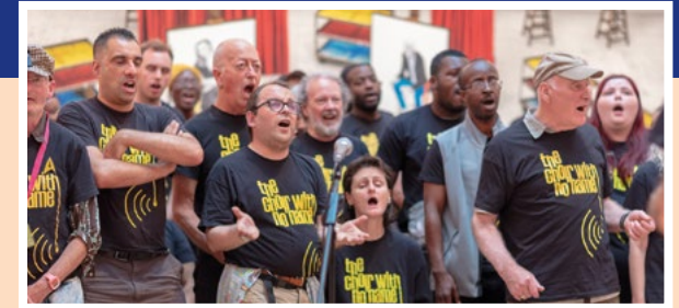
The Choir with No Name

Look Ahead expanded its services across Kent, where we now deliver mental health, learning disability, young people, homelessness and domestic abuse services.