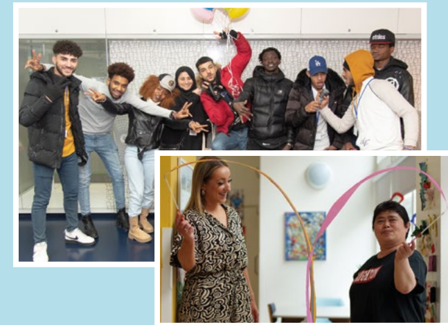
Customers having fun at our 2022 Customer Celebration Event; Inset: A customer and staff member in our RBKC learning disabilities service

Look Ahead celebrated its 50th anniversary.