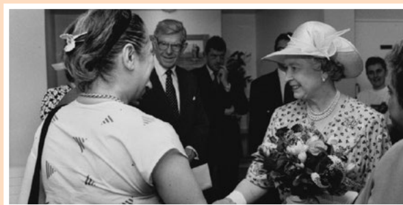
Queen Elizabeth II visits Kean Street

Frogmore Court opened in Maidenhead, providing 24-hour accommodation-based support to young people aged 16-25.